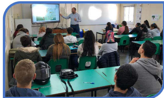
STUDENTS ATTENDED A TALK BY THE NAUTILUS PROJECT IN PREPARATION FOR THEIR "PLOGGING" EVENT