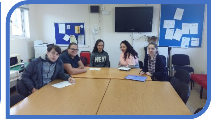
L1 FUNCTIONAL SKILLS ENGLISH ORAL