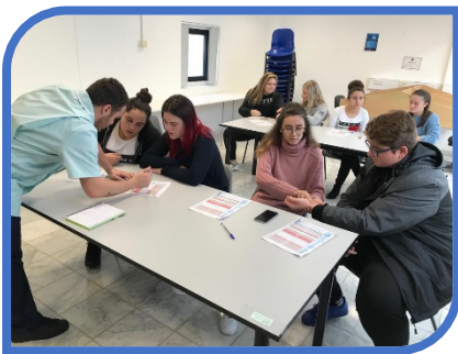
HSC STUDENTS AT WORK EXPERIENCE