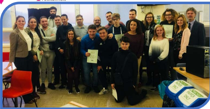
CONGRATULATIONS TO THESE STUDENTS ON THEIR MATHS AWARDS!