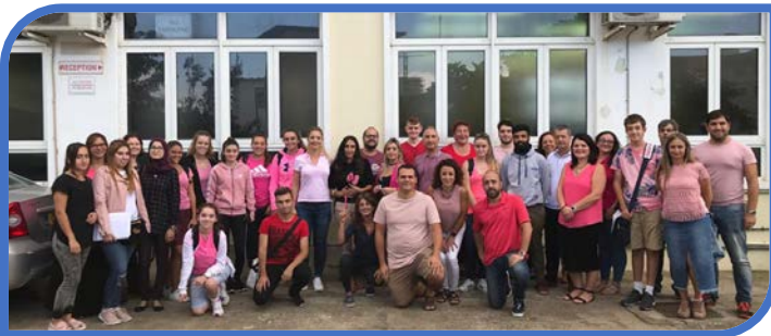
thinkpink FOUNDATION THINK PINK DAY - 5 TH OCTOBER 2018

We all strive for perfection in order to fit in with society but what we do not realise is that in doing so, we leave behind everything that makes us unique. Believe in yourself and do what makes you happy, take that step and pursue your ambitions no matter how out of reach it may seem. The sky is the limit!