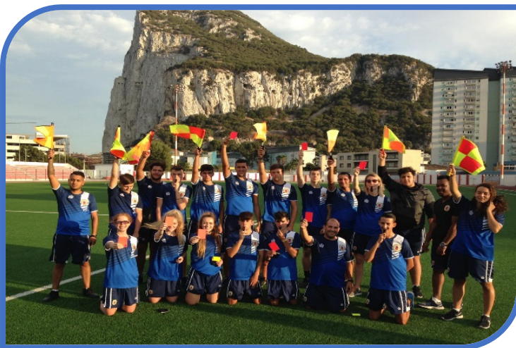
LEVEL 2 SPORTS STUDENTS ATTENDED AN EXTRA 15 HOURS OUTSIDE OF THEIR TIMETABLE TO COMPLETE A FOOTBALL REFEREE COURSE - WELL DONE TO ALL!

If you ever need to contact or are in need to speak to someone, do not hesitate to contact your teacher or GibSams. You can find them by calling 116123, find them on their Facebook page called GibSams and send a message or email: info@gibsams.gi